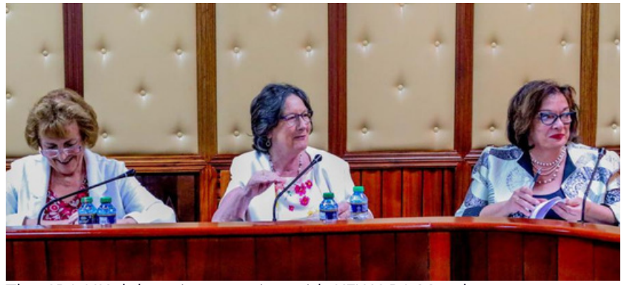
The CPA UK delegation meeting with KEWOPA Members.

Representation of Women and Persons with Disabilities In welcoming the CPA UK delegation to the Kenyan Parliament, the Speakers of the National Assembly and the Senate both stressed the important role of the 2010 Constitution in strengthening the representation of women within parliament. Article 27 of the Constitution provides that no more than two-thirds of members of all elected and nominated positions are of the same gender. The constitution reserves 47 seats for women in the National Assembly and 16 in the Senate. There are also 12 seats for special interest groups, including persons with disabilities, in the National Assembly and 4 in the Senate.