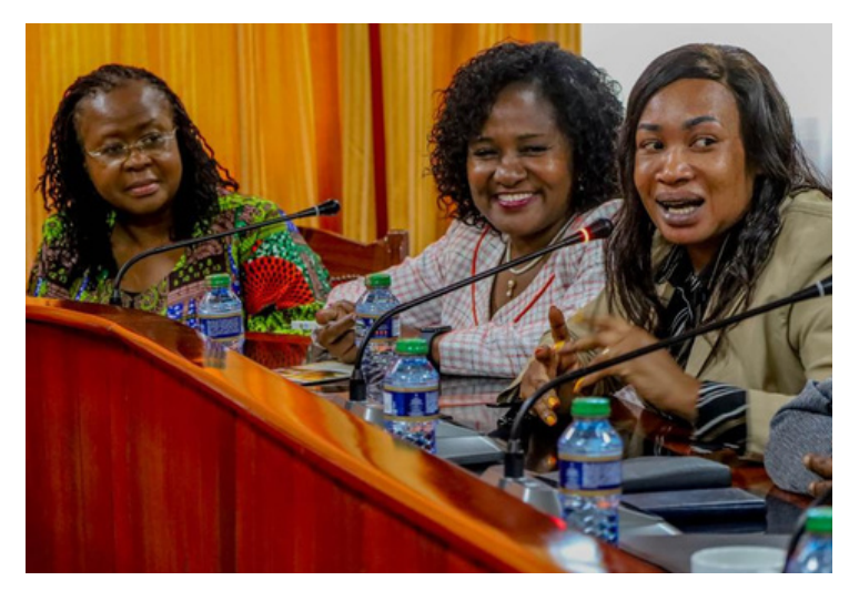
The CPA UK delegation meeting with KEWOPA Members.

CPA UK is currently working with the Parliament of Kenya to organise a workshop on gender-based violence and modern slavery in November 2023. CPA UK will engage further with KEWOPA members and NGOs through this workshop.