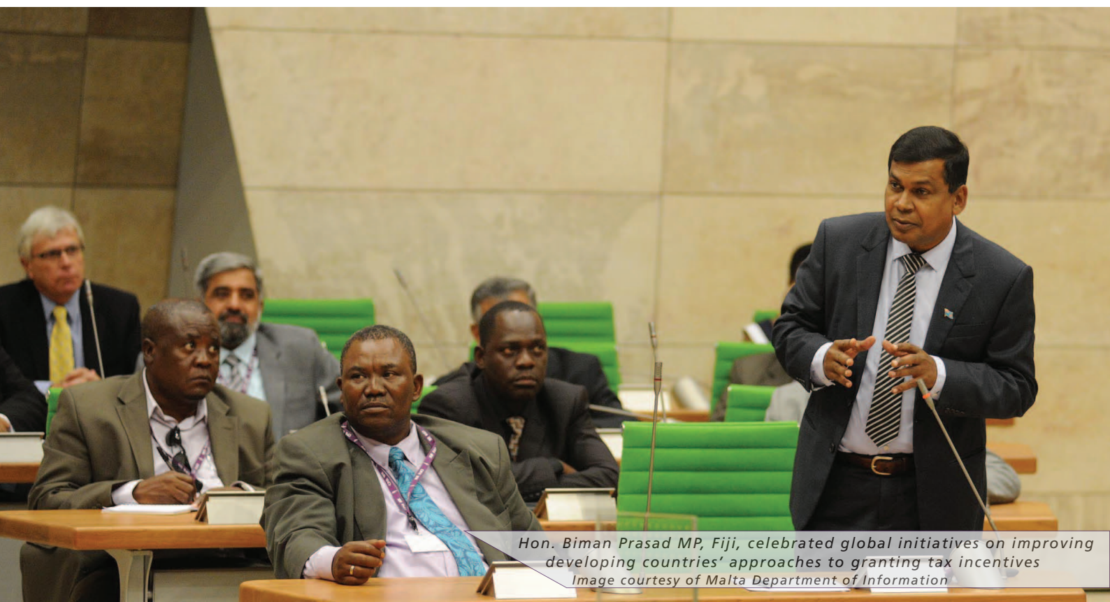
Hon. Biman Prasad MP, Fiji, celebrated global initiatives on improving developing countries' approaches to granting tax incentives

of proposed Sustainable Development Goals (SDGs), taxation is expected to play an important role in the future financing for development arrangements. It was stressed that developing countries should consolidate their soft power by formulating a common position to seek influence at the international tax negotiations. The discussion touched upon particular economic challenges faced by small states and their propensity for offering tax incentives to foreign investors. It was noted that tax incentives, while having the power to boost the receiving country's economy, do not by definition have a positive impact for long-term sustainable growth – careful formulation of tax policies is required in this regard. On a broader scale, it is important to distinguish between low taxation to help a developing economy and money laundering. The current international processes on taxation are not particularly targeting developing countries' tax regimes, but rather focusing on ensuring transparency and exchange of information on these practices - an effort that requires the joint focus of the whole international community.