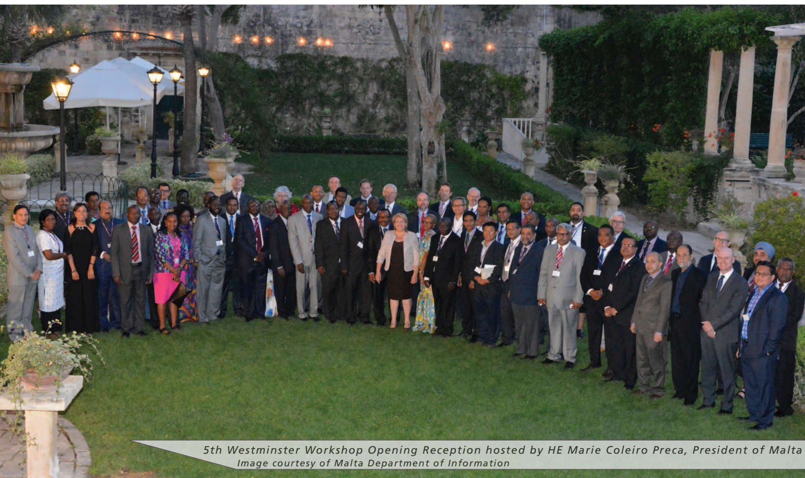
5th Westminster Workshop Opening Reception hosted by HE Marie Coleiro Preca, President of Malta

By specifically dedicating part of the programme for CAPAC related discussions, it was hoped that this would lay the foundations for a strong association capable of actively supporting PACs across the Commonwealth.