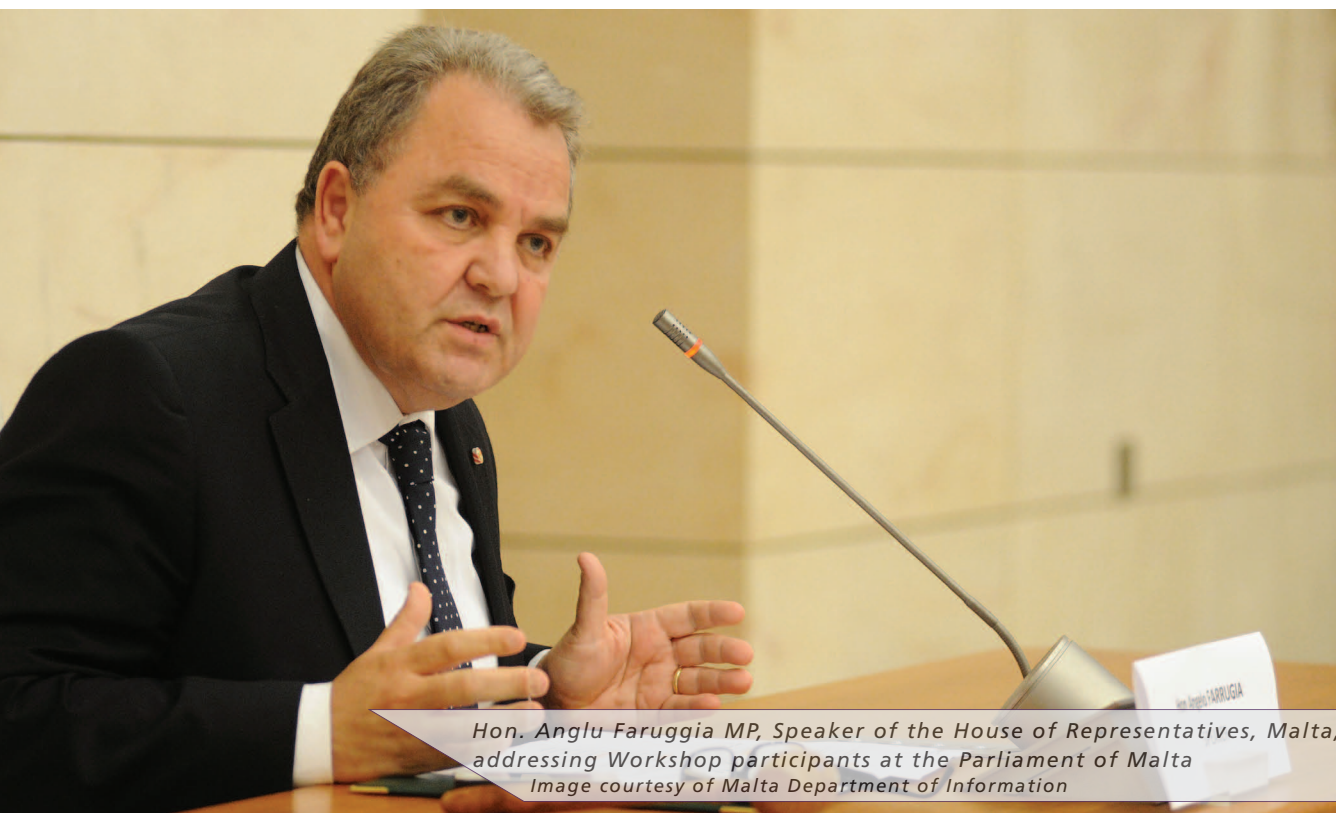
Hon. Anglu Farrugia MP, Speaker of the House of Representatives, Malta, addressing Workshop participants at the Parliament of Malta

A wide range of panellists took part in the Workshop, from UK MPs to international experts, journalists and senior parliamentary staff. Their individual perspectives offered a complementary analysis intended to better equip PAC Members and Clerks to engage with financial scrutiny in their committee work.