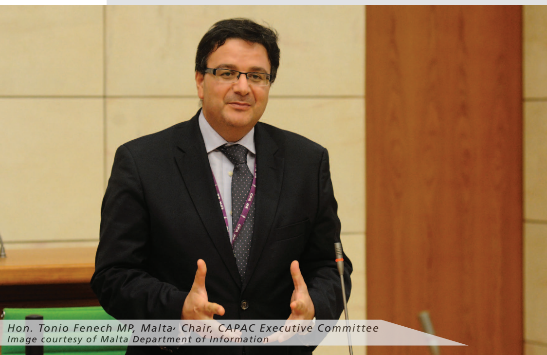
Hon. Tonio Fenech MP, Malta, Chair, CAPAC Executive Committee