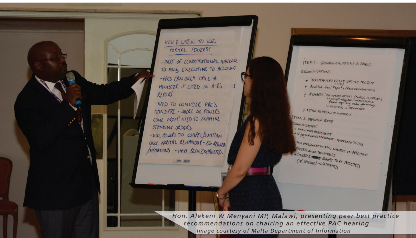
Hon. Alekeni W Menyani MP, Malawi, presenting peer best practice recommendations on chairing an effective PAC hearing

PAC. PACs could look into a cluster of reports on a single subject over a period of time, as well as consider conducting landscape reviews. The latter can also act as a means of providing external expertise on a topic (limited to financial audits). The role of the Clerk is key to assessing whether PAC recommendations have been acted upon. The large volume of committee work calls for prioritisation, such as selecting areas which the committee found to have been particularly poor the first time round. Clerks would then commit to come back to the area specified. Alternative mechanisms include committees agreeing on a schedule for "recall" – holding a hearing regularly (e.g. every quarter of the year) where past reports are revisited briefly (not a full investigation), based on an SAI brief. In the future Clerks could appoint individual members as rapporteurs to monitor particular enquiries, as a way of prioritising time and labour.